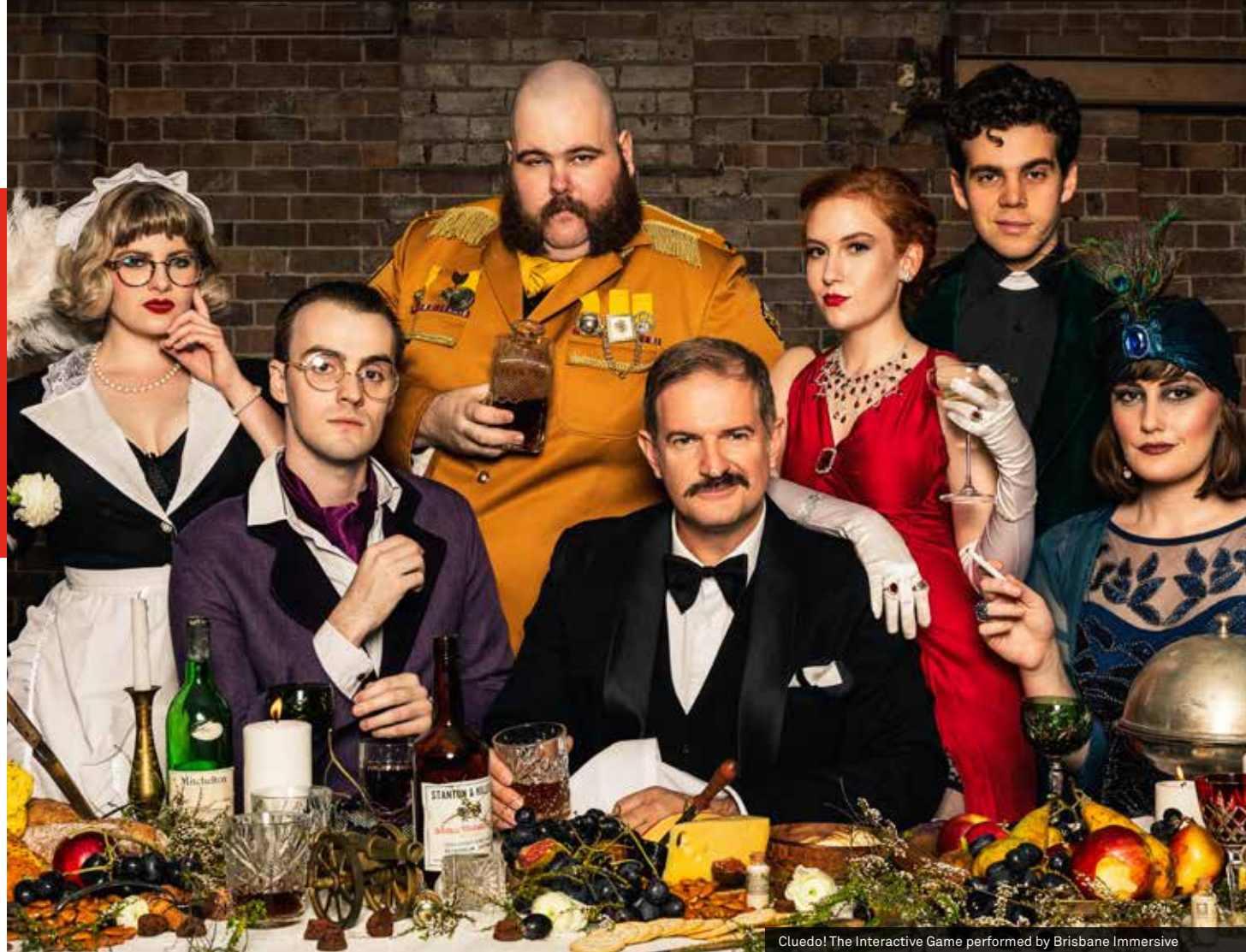
Cluedo! The Interactive Game performed by Brisbane Immersive

This is a must for theatre lovers, an ever-growing calendar of productions that is setting the bar for entertainment at sea. Picture jaw-dropping towering acrobats, or The Best Exotic Marigold Hotel , even an immersive murder mystery dining experience. This is a new era for Cunard theatre and its future is exciting.