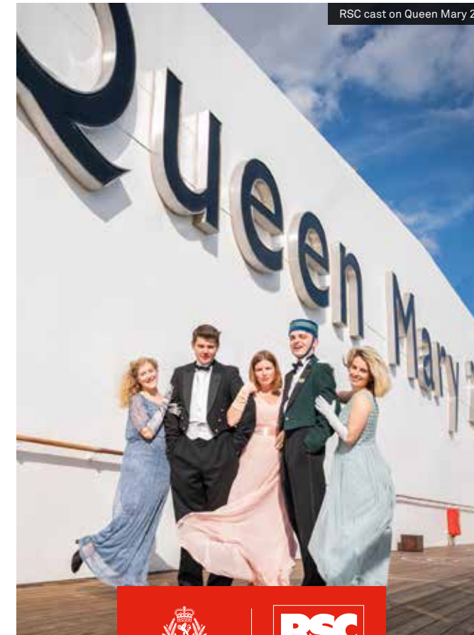
RSC cast on Queen Mary 2