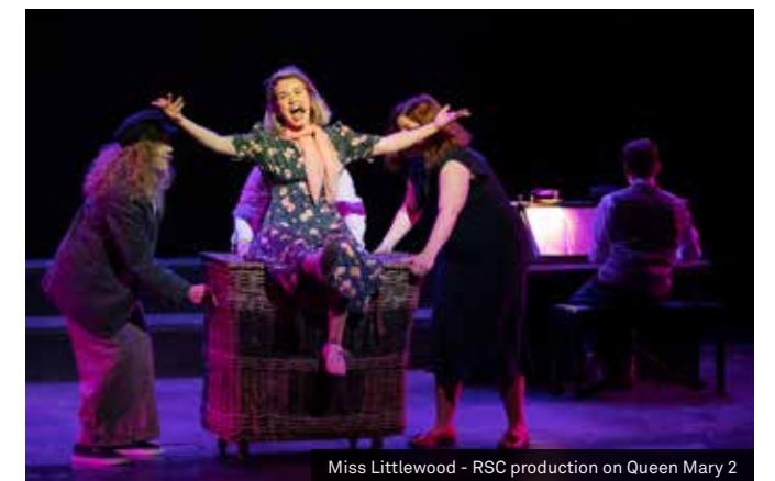
Miss Littlewood - RSC production on Queen Mary 2

Actors from the Royal Shakespeare Company spend seasons on board Queen Mary 2 enchanting guests with their stage productions and behind-the-scenes knowledge. Workshops are a delight; you may realise a talent for playwriting. And in the evenings, meet the actors for Shakespeare Tales , their intimate and informal performances of their favourite pieces.