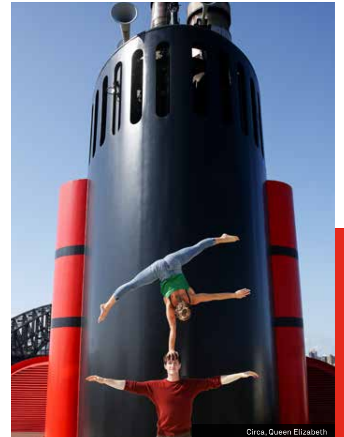
Circa, Queen Elizabeth